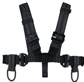
RL CHEST W0200BB