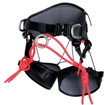
ARBO MASTER W0105BR